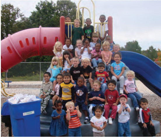
Wellborn's Bright Beginnings DayCare recycled over 40 lbs. of paper teaching the youngest members of the Wellborn family about environmental stewardship.

Aluminum and plastic are collected and sent to local recycling centers.