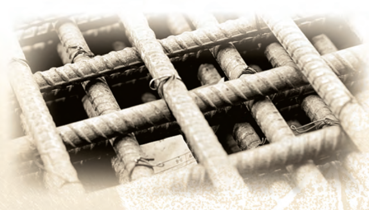
Steel and Concrete Comparison to Wood

Wood is the most renewable resource we have. Its production uses the least amount of energy, emits fewer greenhouse gases, and produces less air and water pollutants. Here's how steel and concrete compare: (Canadian Wood Council, www.cwc.ca )