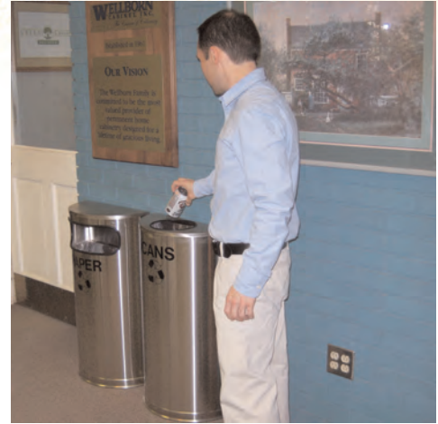
Wellborn employees also pitch in to do their part for the environment.